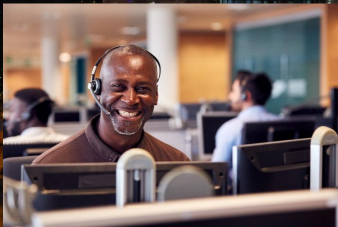
Customer Service & Hospitality