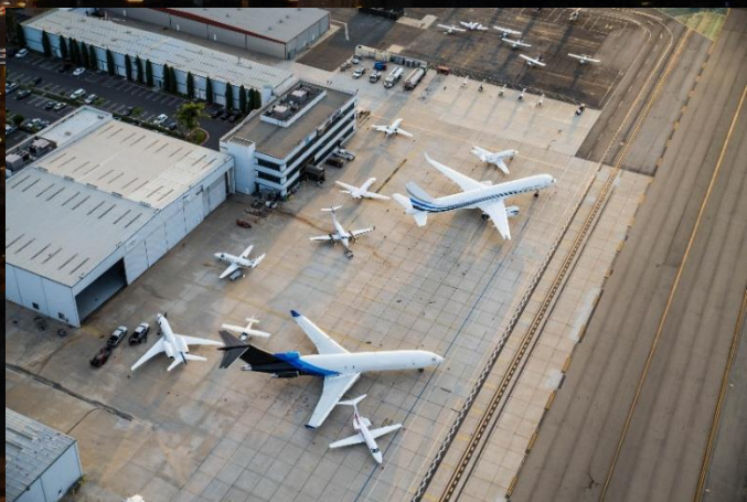
Transportation, Supply Chain & Logistics