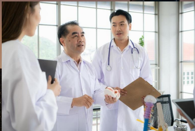
Healthcare & Social Service